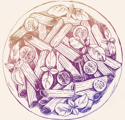
Bolognese Penne Iberico Pork / Pancetta / Cheese Fondue