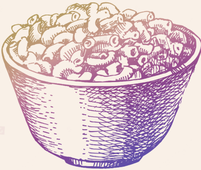
Baked Mac & Cheese Sausage / Velveeta Cheese / Crumbs