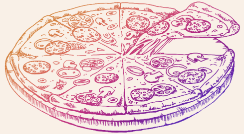
Pita Pizza Mozzarella Cheese / Pepperonis / Marinara Sauce